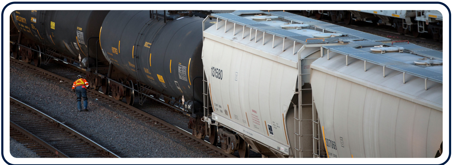
Railroad switching yard in Illinois.