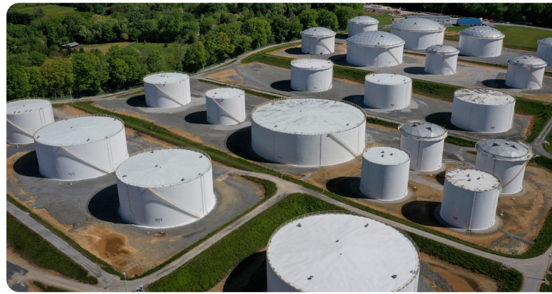
Fuel holding tanks at Colonial Pipeline's Dorsey Junction Station in Woodbine, Maryland.

Meanwhile, there are numerous other challenges. The strategy and policy documents governing critical infrastructure have become stale. The current systems for designating sectors as critical and for mitigating cross-sector risks are inadequate. DHS's Cybersecurity and Infrastructure Security Agency (CISA) is unable to fulfill its responsibilities, and it does not receive the interagency support necessary to act effectively as the national risk manager. Voluntary security relationships are not delivering the necessary results. Additionally, processes for sharing information, responding to emergencies, designating priority infrastructure within sectors, and promoting resilience are insufficient.