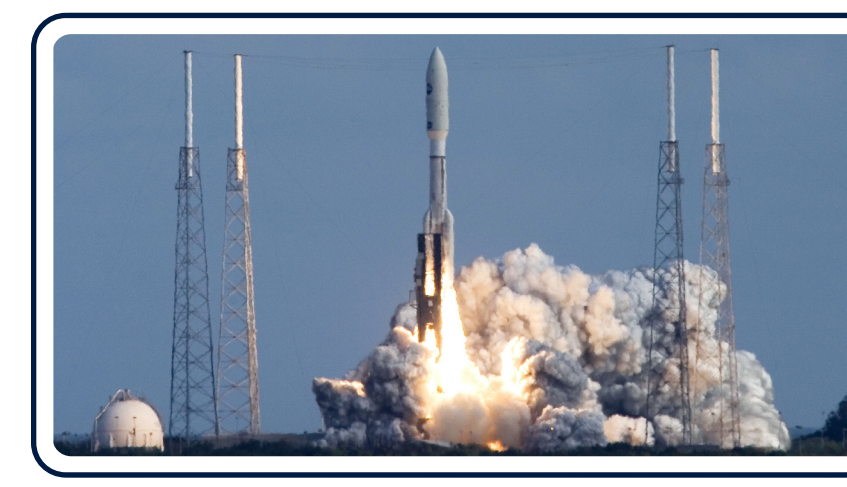
Today's space race features not only weapons systems but also satellites that provide global positioning, remote imagery, and communication services. These services are integral both to America's national security and to its economy.

More than a decade ago, the U.S. National Security Space Strategy warned that space will become more "congested, contested, and competitive."<sup>3</sup> This warning proved prescient, but the U.S. government has not done enough to adapt to that reality. Major portions of American space systems are still not